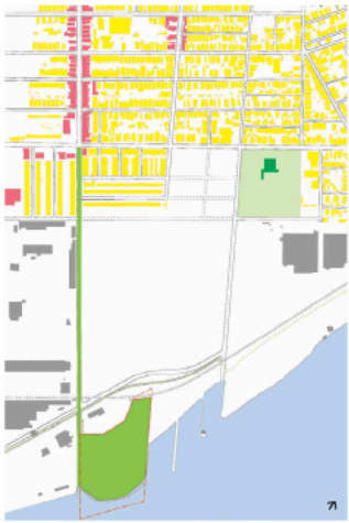
Site in relation to the residential center of Bridesburg.

The Bridesburg Riverfront Park public engagement process was an interactive six month process with the Bridesburg community, DRCC, and Philadelphia Parks & Recreation culminating in a community-informed master plan for a 10 acre parcel of land on the North Delaware River.