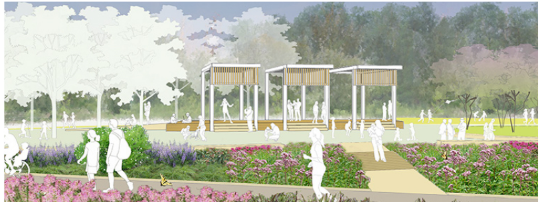
The fully accessible Picnic Pavilion provides shade and is suitable for many types of events.

The three park pavilions serve as hubs for gathering and various activities for regular users and occasional visitors to the park. The Trailhead and Welcome Center provides needed restroom facilities and wayfinding tools; the Picnic Pavilion serves as a flexible gathering place for events from farmer's markets to family reunions; and the Stage Pavilion serves as a cultural celebration point for music and performance.