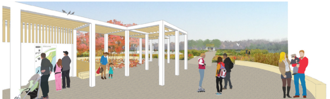
A simple trellis, raised deck, and seat wall screens the fully accessible composting toilet facility while creating a gateway place for gathering and wayfinding.