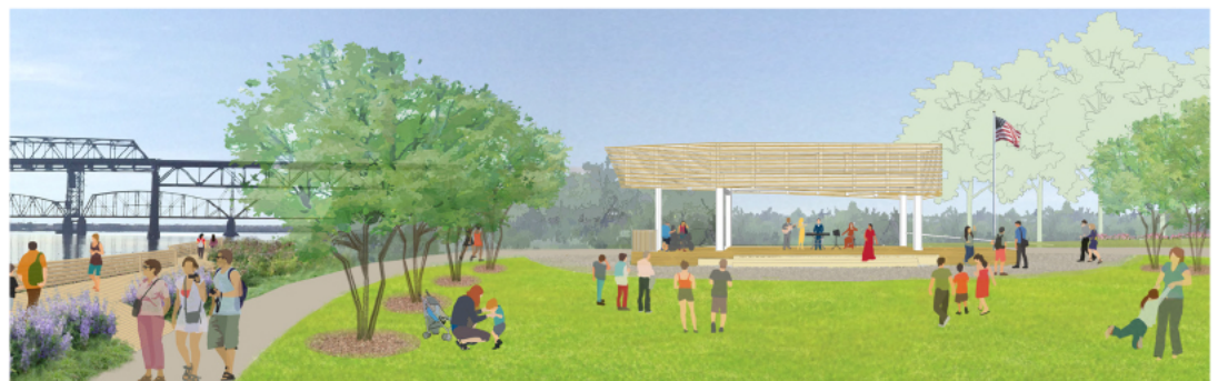
The Stage Pavilion's proximity and views to the River are enhanced by its architectural form that references a ship.