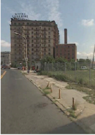
Vacant parcel adjacent to the once-grand Divine Lorraine

The impressive historic Divine Lorraine Hotel sits majestically at the intersection of Broad Street with Fairmount and Ridge Avenues, but it had been vacant, neglected, and vandalized for many decades. This phased development study explores student university housing on the adjacent parcel to the east of the building along with restorative and modernizing renovations to the existing hotel building. The final mixed-use build out proposes over 800 residential units and nearly 100,000 sf of commercial spaces with underground parking. The new community is centered around a courtyard that is engaged by commercial and social spaces on the ground floors with varying heights of residential buildings above.