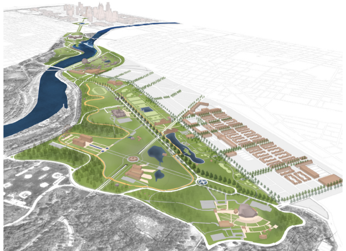
The Master Plan organizes and engages an undifferentiated historic park with new neighborhood resources, revitalized landscapes, re-invigorated venues, and a district wide multi-use trail that connects to regional networks.