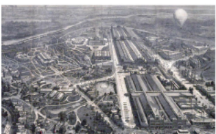
The Centennial Exhibition of 1876 celebrated Philadelphia as the Workshop of the World