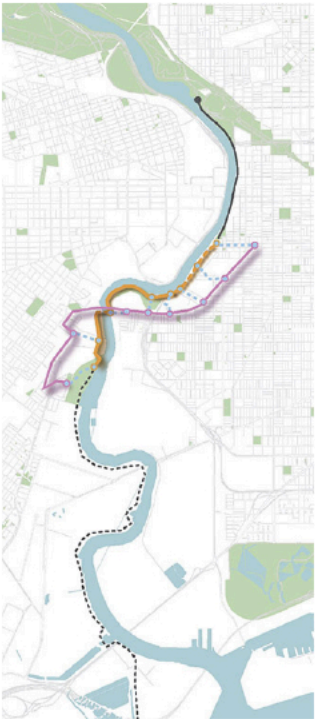
Two trails are proposed: on-street and off-street to address phasing limitations.