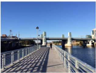
The popular boardwalk built in 2014 was a concept proposed in this Plan.