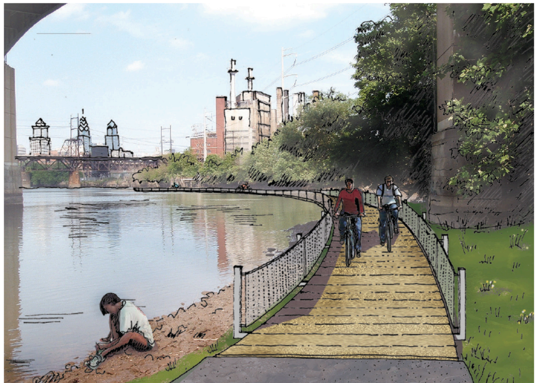
A boardwalk extension to the recreation trail at Schuylkill Banks was envisioned to overcome the challenge presented by the tidal river and limited land along the river’s edge.

Danielle served as the lead planner responsible for determining trail routes and guidelines for both water and land. In determining the routes, we assessed dozens of waterfront parcels for ownership rights, access points, assets and landmarks, and viability of trail development. In order to connect from the east side to the west side of the river, we proposed to reorient an existing railroad bridge for recreational users only. This unique solution makes use of a defunct, historic piece of infrastructure, keeps vehicular and recreation uses separate, and encourages users to have an intimate experience of the river. The success of the master plan is evident in the number of SRDC trail projects for which it laid the framework, including the popular on-water boardwalk completed in 2014, Grays Ferry Crescent Park completed in 2010, and a bridge crossing to Bartram’s Garden via the abandoned railroad trestle which is currently in design.