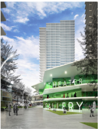
View of the pedestrian street through the site