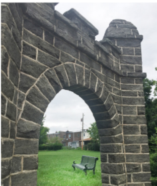
Park assets are in need of repair and assessment

*work completed while principal at Locus Partners