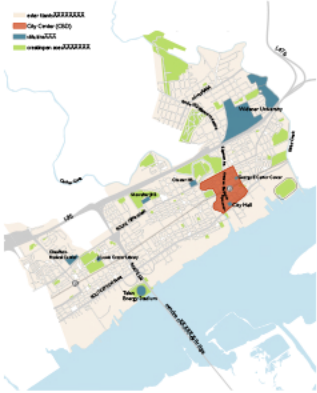
Open space assets in relation to major institutions and the city center