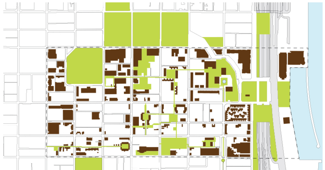
Modern residential interventions reinforced and weaved together the existing small scale colonial fabric by introducing similarly scaled pedestrian walkways, courtyards, and parks.