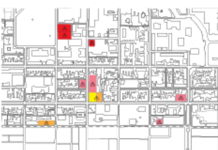
Commercial parcels at-risk for redevelopment

*work completed while principal at Locus Partners