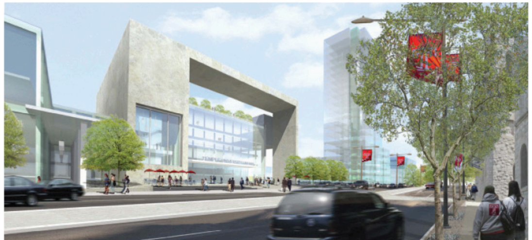
Broad Street is reclaimed, a new central quad is created, the southern gateway is strengthened with a new residential village, and science and research facilities expand significantly