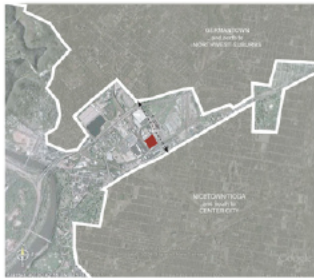
Site location in industrial zone