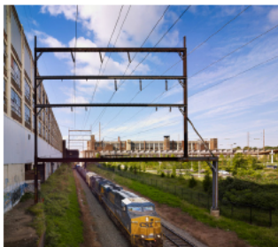
Site proximity to major transit