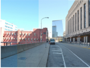
Existing barren 30th Street sidewalks