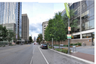
Existing 37th and Market Streets is dominated by fast moving vehicles and has limited outdoor social places