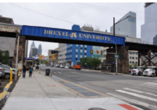
Existing desolate streetscape and high line overpass at 31st and Market

University City's rate of commercial and institutional development is moving faster than the improvements to the streets and sidewalks around the new buildings. As stewards of the public realm, UCD asked us to study three tired and desolate streetscapes and recommend improvements to the pedestrian experience as the area awaits longer-term investments and permanent capital improvements. Knowing UCD had limited financial resources for the implementation, we proposed short-term and low cost interventions that would engage pedestrians and provide useful "drop-in" places along these urban corridors. Both 30th and Market Streets serve as host to a number of food trucks, however, the surrounding areas do not have appealing or convenient places to sit and enjoy a quick lunch with a colleague. Our proposal includes a set of standing tables and planters that could be deployed in various configurations on sidewalks and on parklets. These areas were marked with colorful graphic "tablecloths" and flowering plants to make a quick lunch or commute more enjoyable.