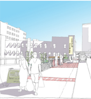
Proposed standing tables and planters create visual interest and a place to grab a bite